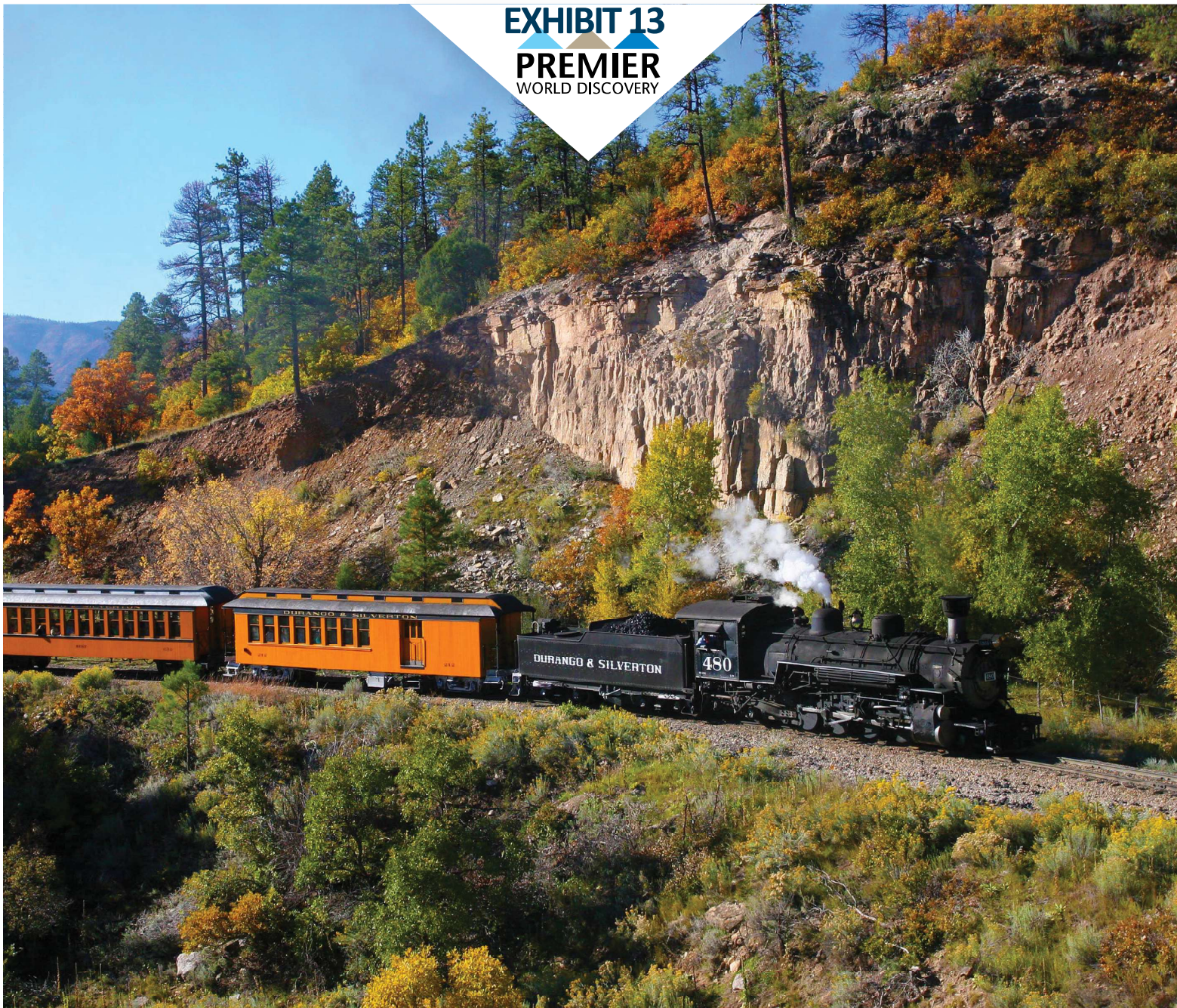
EXHIBIT 13 PREMIER WORLD DISCOVERY