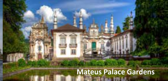
Mateus Palace Gardens