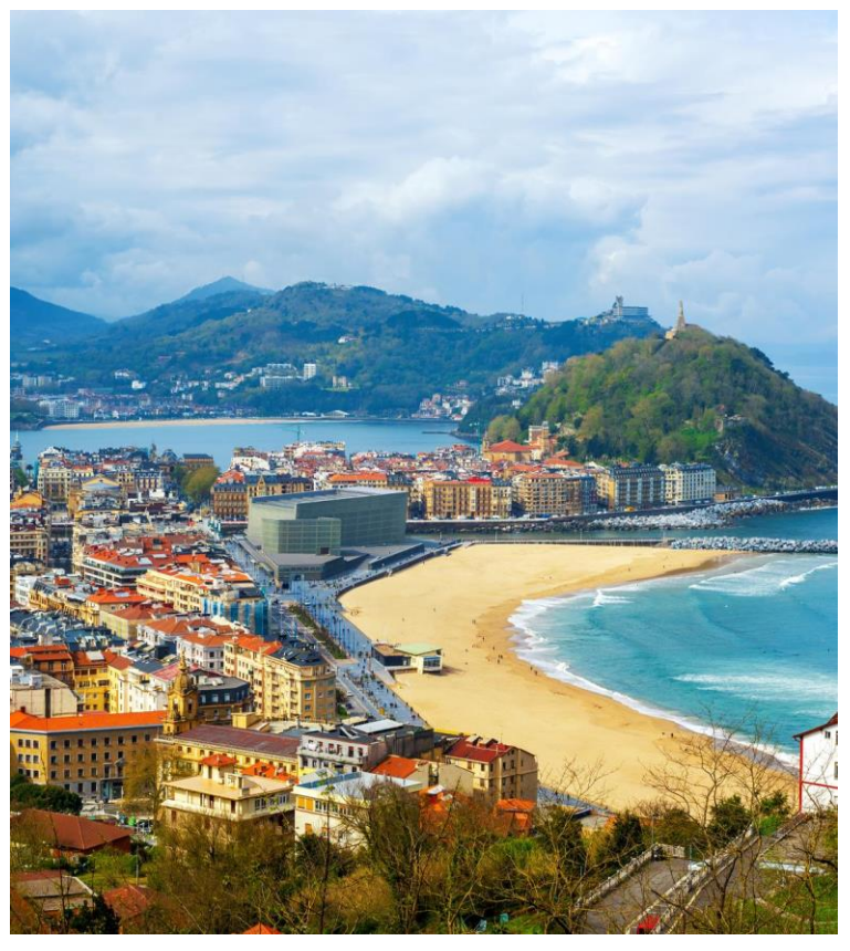
Small Group Travel rewards travelers with new perspectives. With just 12-24 passengers, these are the personal adventures that today's cultural explorers dream of.

16 Days • 22 Meals: 14 Breakfasts, 3 Lunches, 5 Dinners