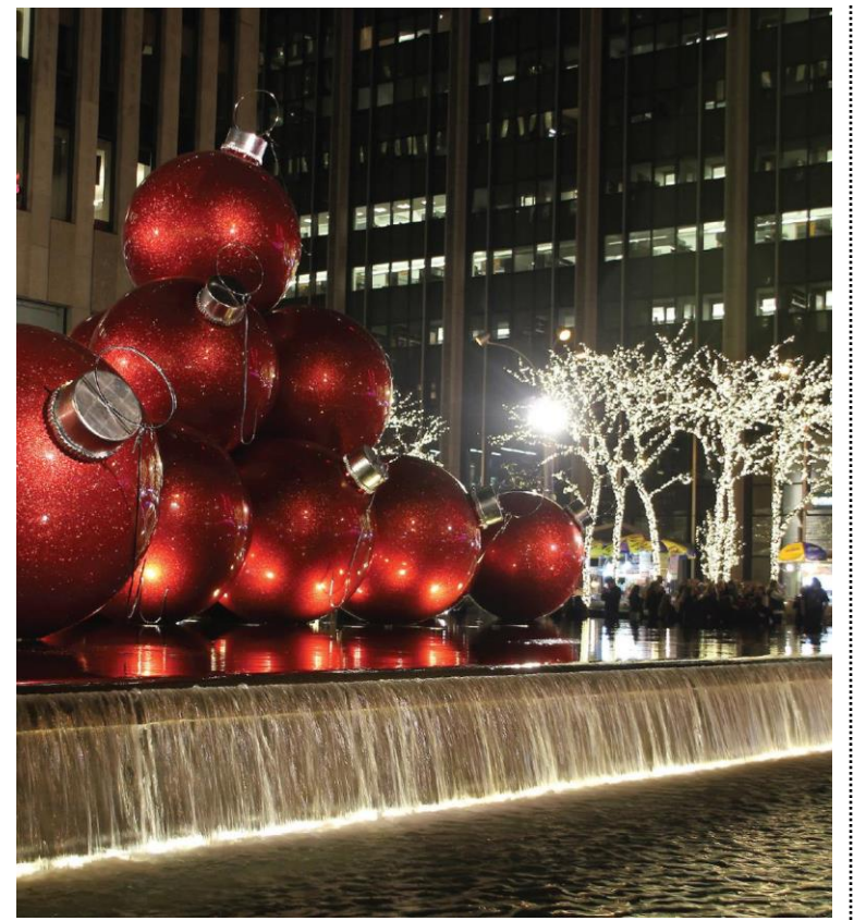
5 Days • 5 Meals : 3 Breakfasts, 2 Dinners

HIGHLIGHTS... Greenwich Village, Wall Street, Christmas Spectacular at Radio City Music Hall, Statue of Liberty, Ellis Island, 9/11 Memorial, 9/11 Museum, Broadway Show