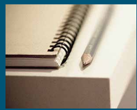
AP Style for Business Writers An AP Stylebook crash course for everyone from writing newbies to AP pros.

Author In You Take your nonfiction manuscript from idea stage to finished draft.