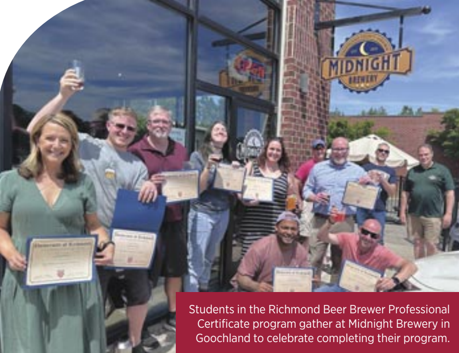
Students in the Richmond Beer Brewer Professional Certificate program gather at Midnight Brewery in Goochland to celebrate completing their program.