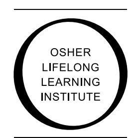
at the University of Richmond osher.richmond.edu