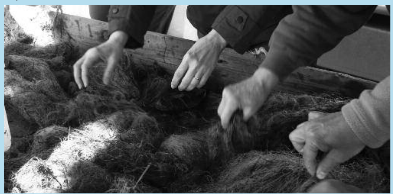
Chesapeake Bay Field Study