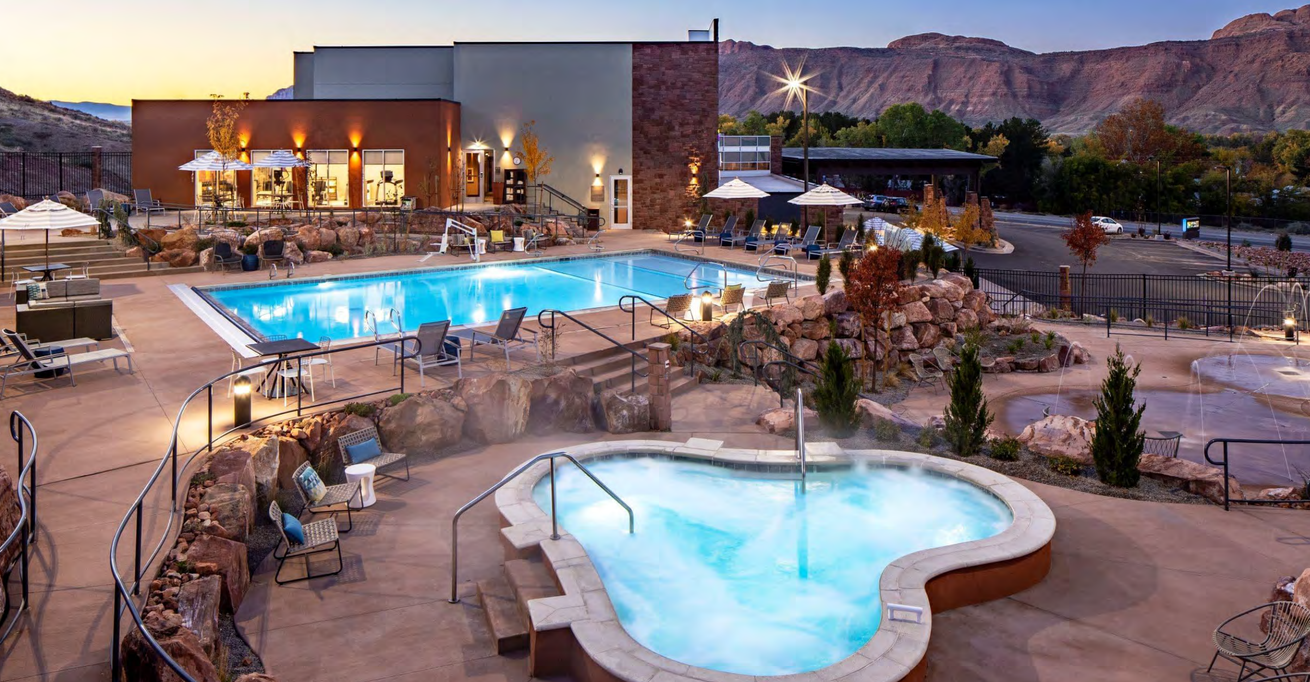
Accommodations - Hyatt Place, Moab – 5 nights