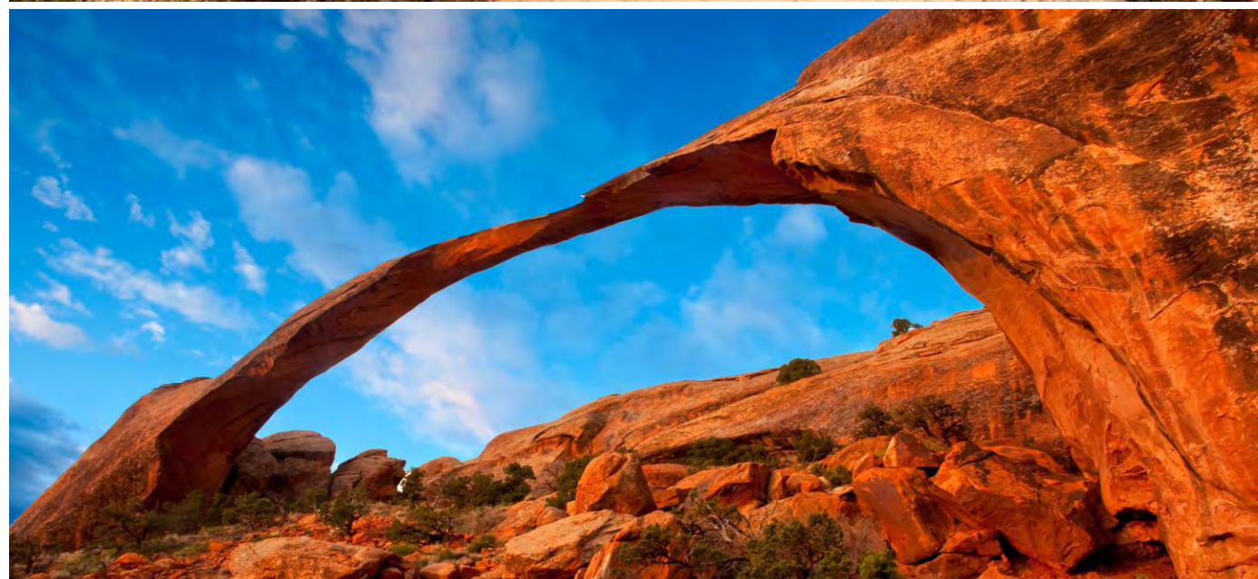
Day 6: Arches National Park - Balanced Rock, The Windows Trail, Double Arch and Landscape Arch