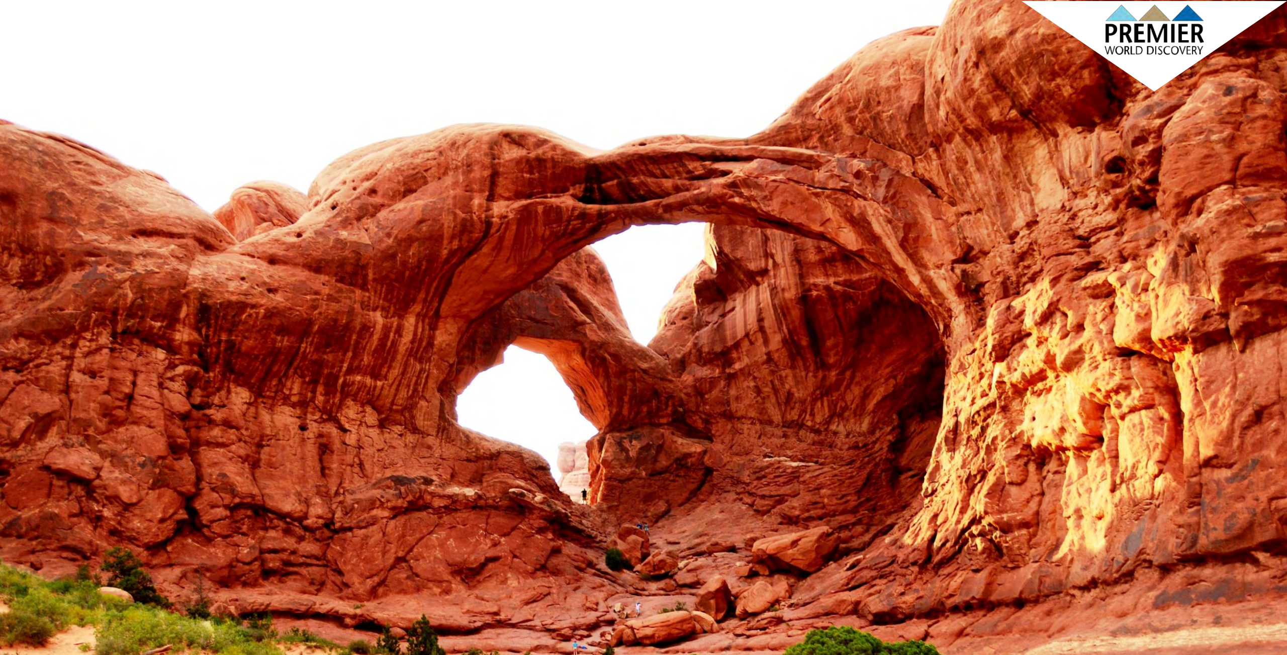
Day 6: Arches National Park – Double Arch