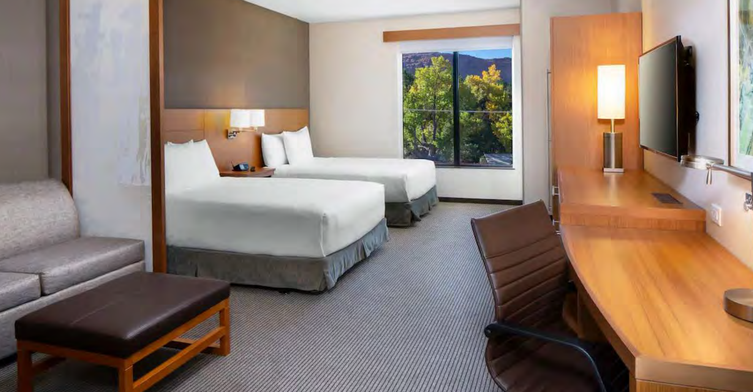
Accommodations - Hyatt Place, Moab – 5 nights