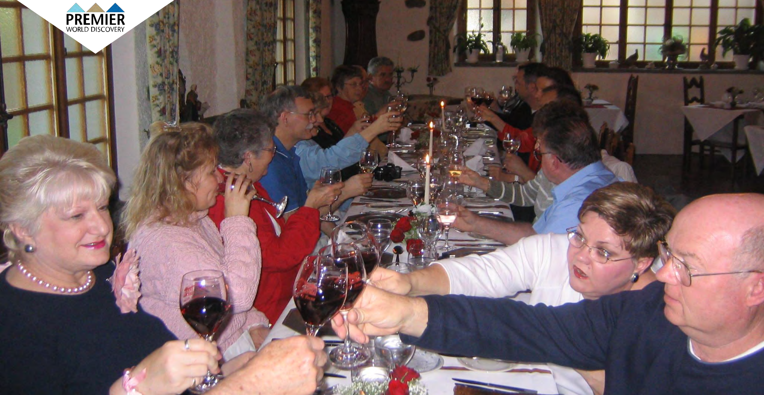
Day 1: Welcome Dinner