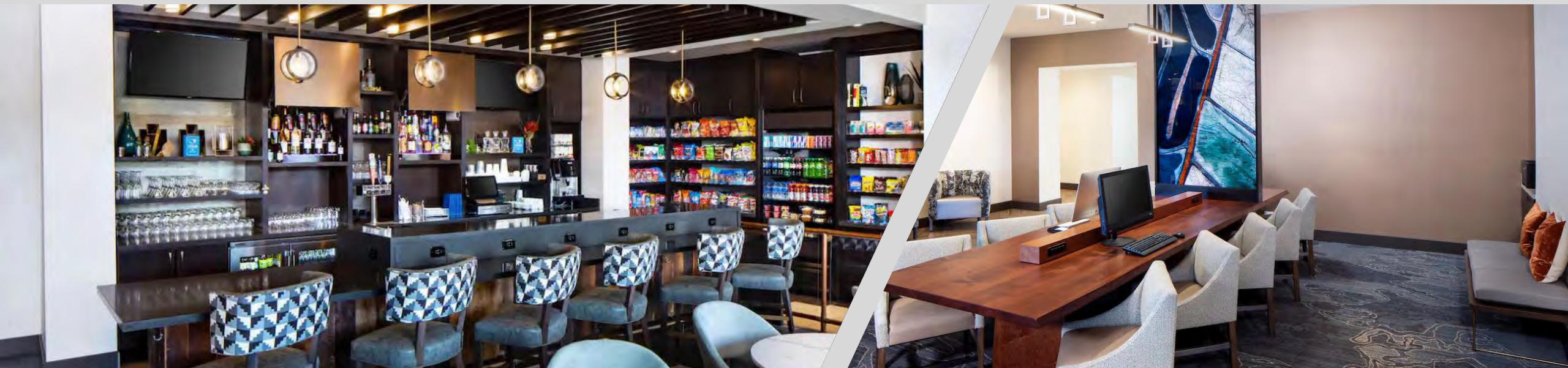
Accommodations - Hyatt Place, Moab – 5 nights