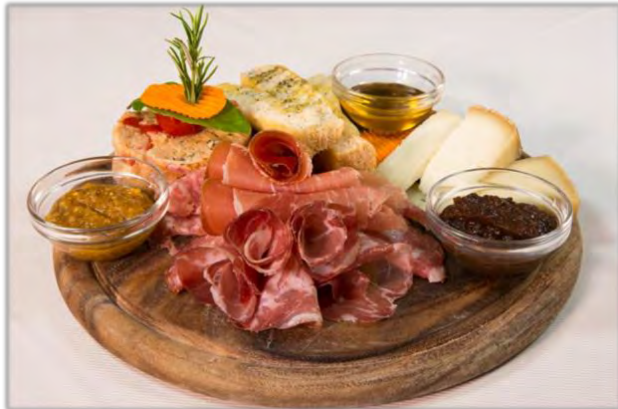
Day 3: Truffle Demonstration - tastings of oil and truffle butter bruschetta, salami, pecorino and wines