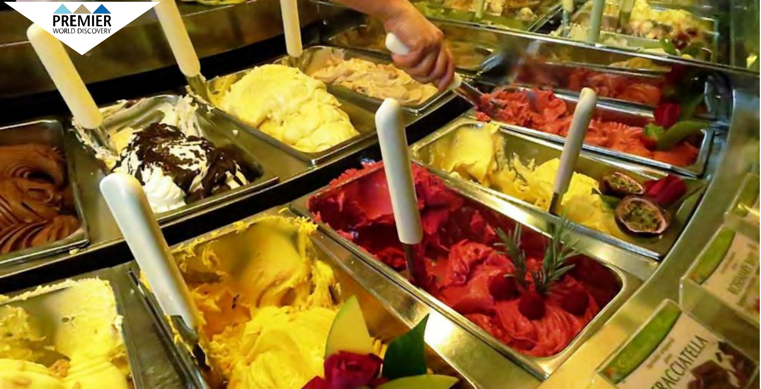
Day 6: San Gimignano Gelato