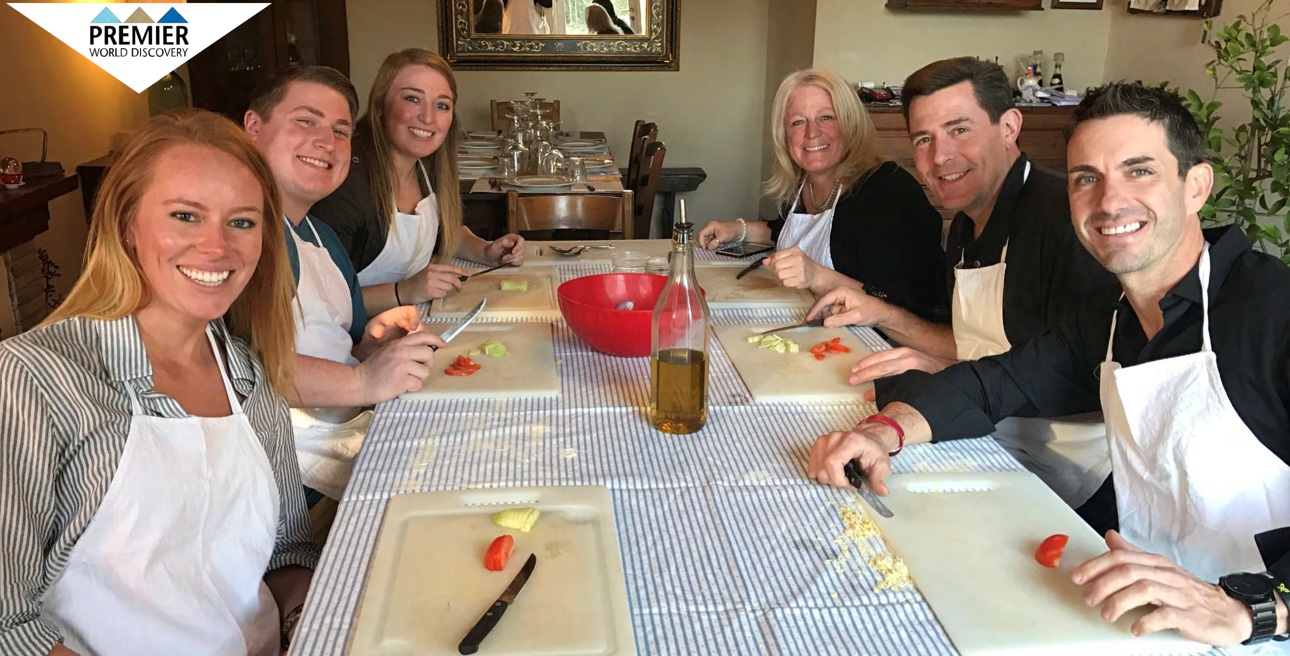
Day 4: San Gimignano– Organic Cooking Class – Pasta Making & Lunch