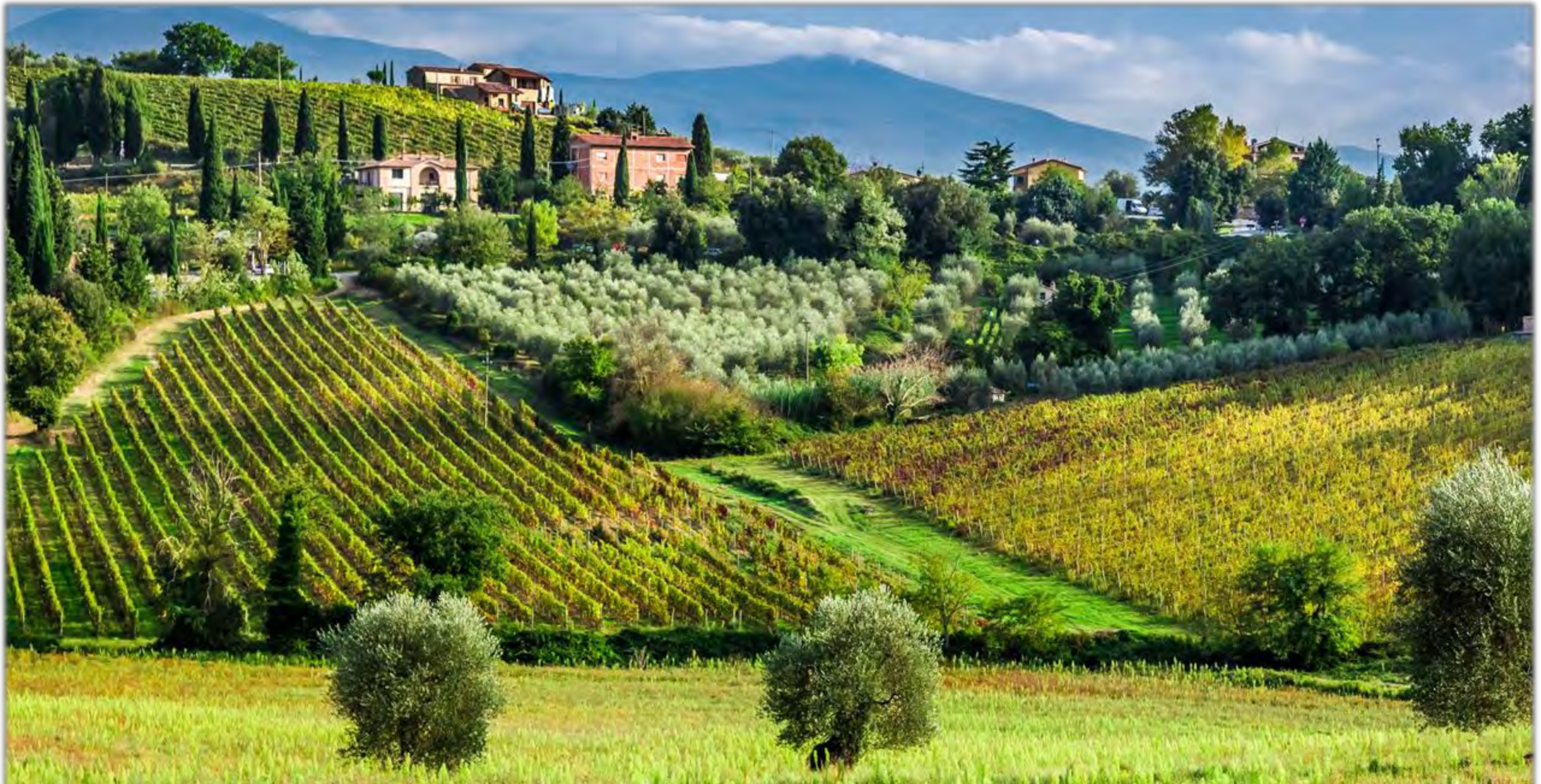
Day 5: Val d'Orcia Region