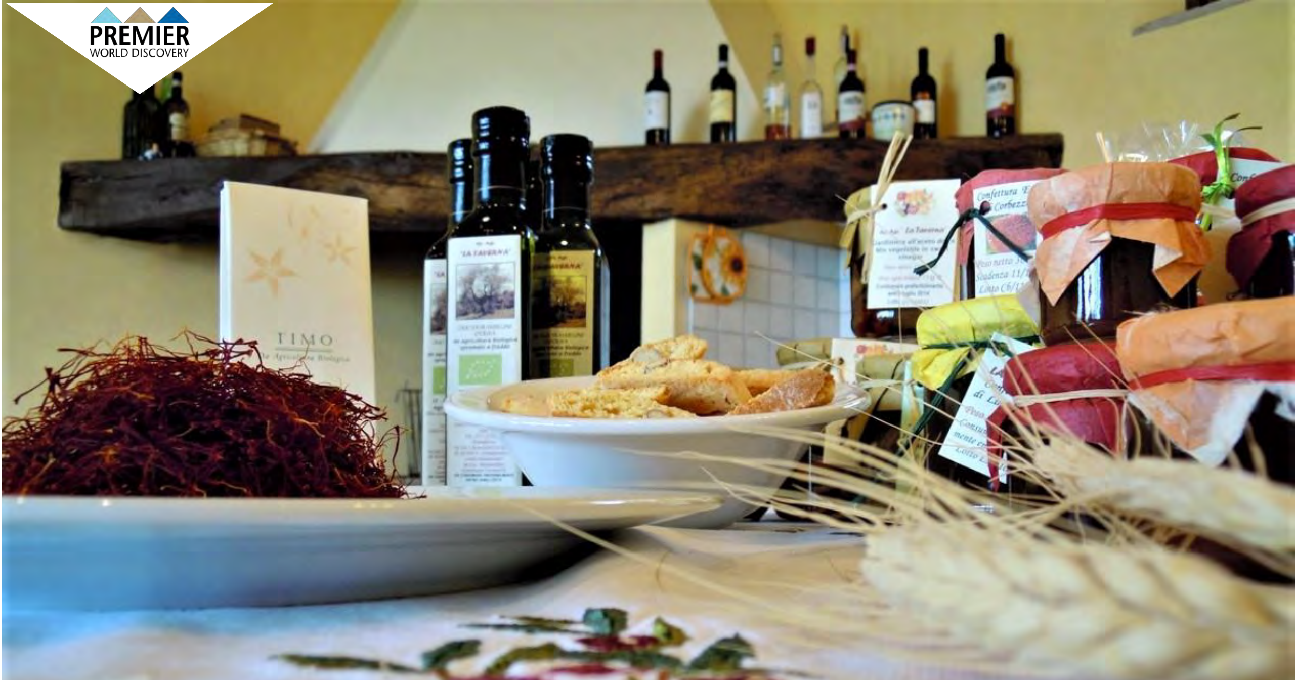
Day 6: Lunch at a family-run farmhouse that specializes in saffron production