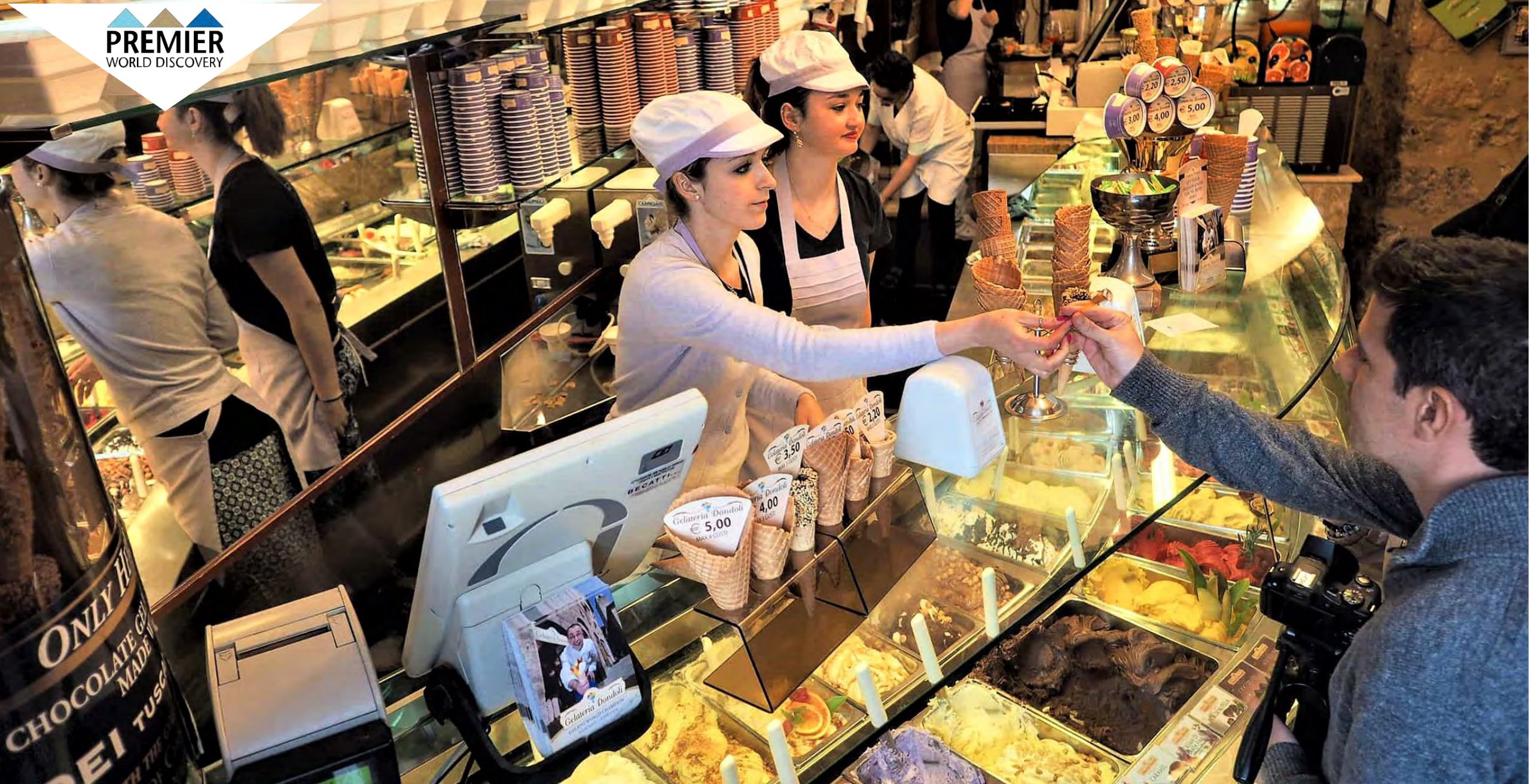
Day 6: San Gimignano Gelato