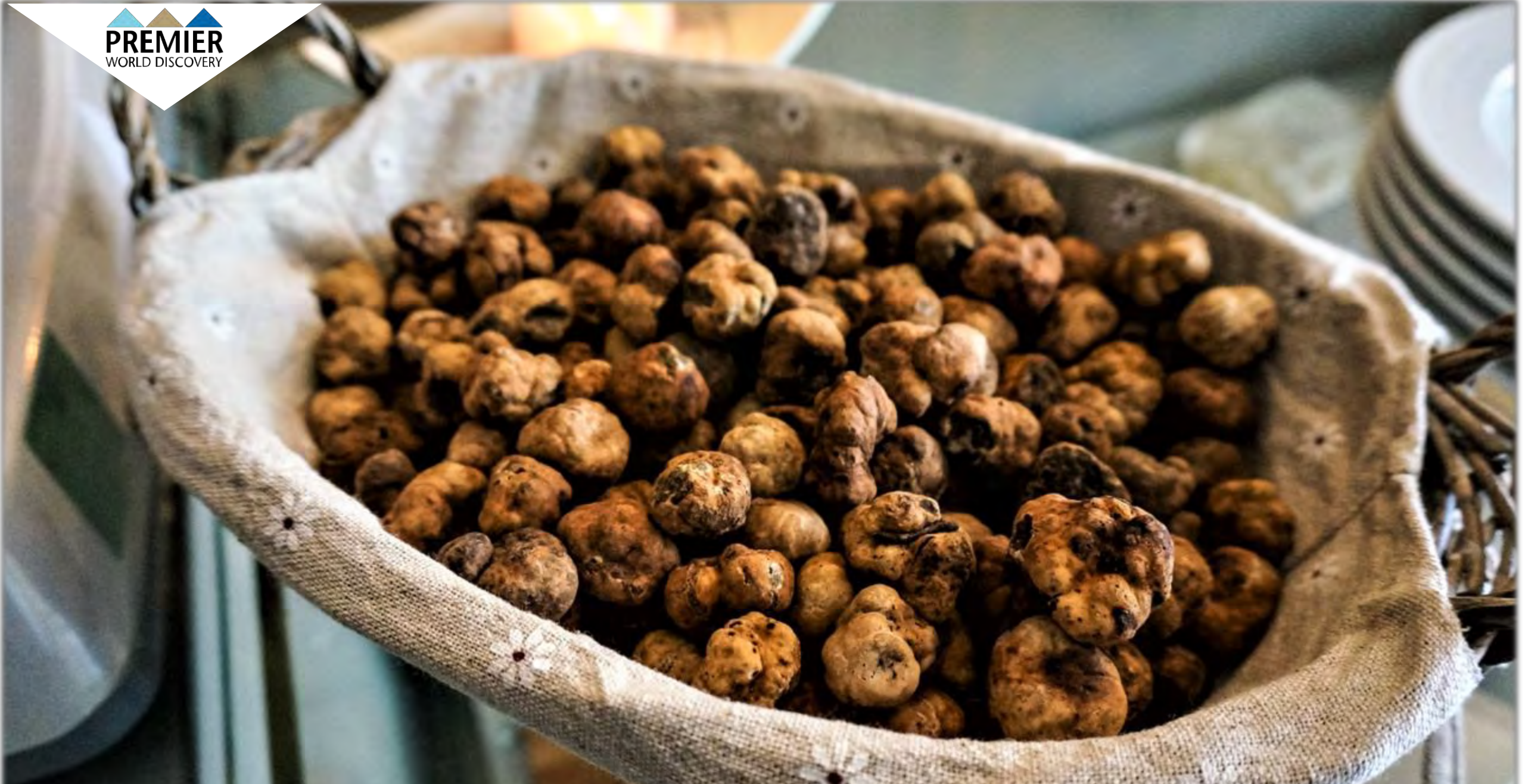
Day 3: Truffles