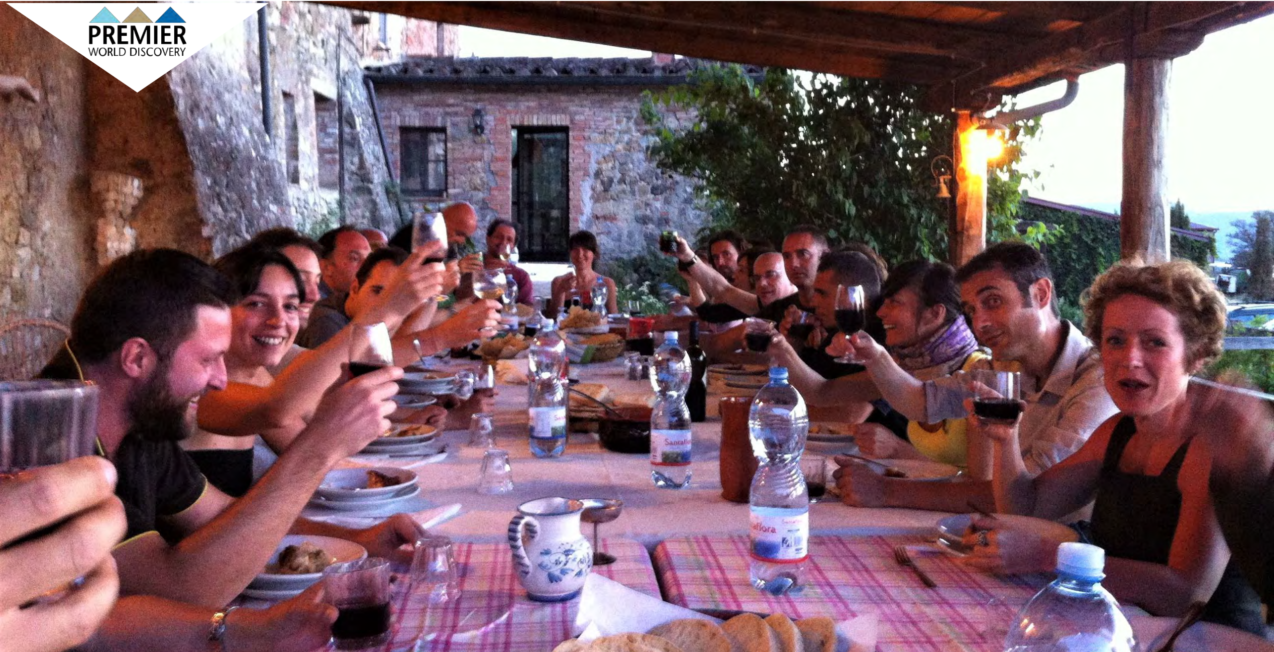
Day 5: Tuscan Farmhouse Dinner