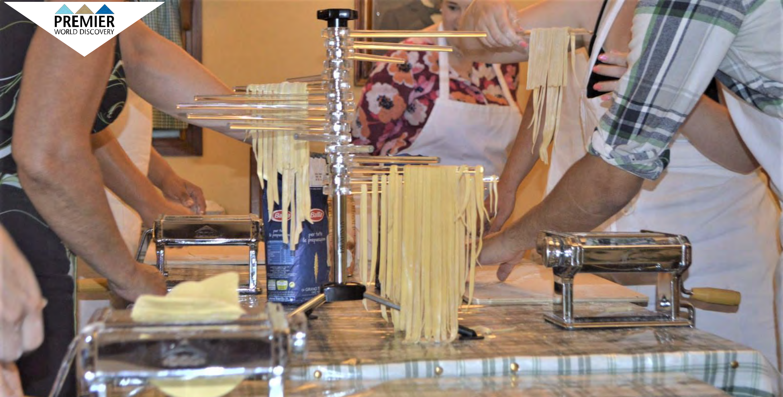
Day 4: San Gimignano– Organic Cooking Class – Pasta Making & Lunch